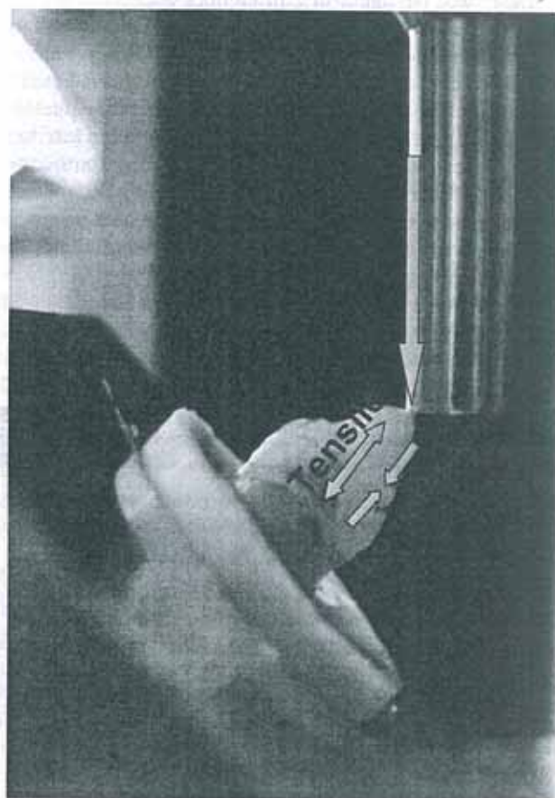
Fig. 1 - Application of the load cell to the laminate-tooth interface in a universal testing machine until fracture.

Statistical analysis was performed using the SAS System for Windows, release 8.02/2001 (Cary, NC, USA). The means of each group were analysed by one-way analysis of variance (ANOVA). P values less than 0.01 were considered to be statistically significant in all tests.